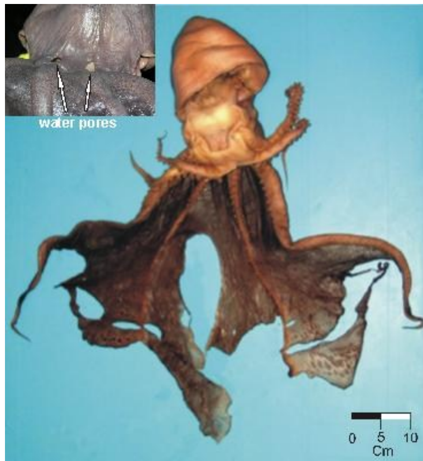
Figure 2. Ventral view of the specimen of Tremoctopus violaceus recorded at Itaipu Beach, Niterói, Rio de Janeiro. Small inset shows the detail of the dorsal water pores.

disorientation. Local fishermen reported that this was the first occurrence of such a specimen at the beach and within their fishing grounds. Despite the fact that the area is daily subjected to moderate fishing activity with beach seining, gill netting and hand lining (Tubino et al. 2007, Monteiro-Neto et al. 2008), there is no recent record of T. violaceus capture in the region with any of those gears.