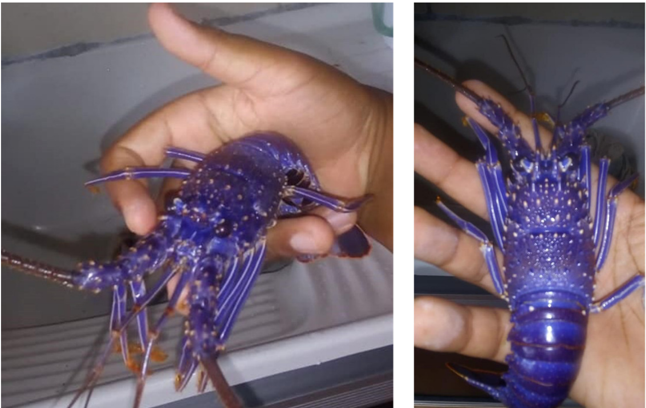
Fig. 3: Blue color phenotype in a specimen of the brown spiny lobster Panulirus echinatus Smith, 1869 captured on the northern coast of Alagoas state along the Brazilian coast in the South Atlantic Ocean, on April 2019 (Photos: José Valdemar de Oliveira).

2002, vanWijk et al. 2005), and as observed in Panulirus cygnus and P. versicolor (Wade et al. 2009). Within lobsters, CRCN forms multimeric complexes that have the potential to generate the diversity of colors observed in crustacean carapaces (Chayen et al. 2003, Wade et al. 2009). The binding of the carotenoid astaxanthin (AXT) in the protein multimacromolecular complex crustacyanin (CRCN)