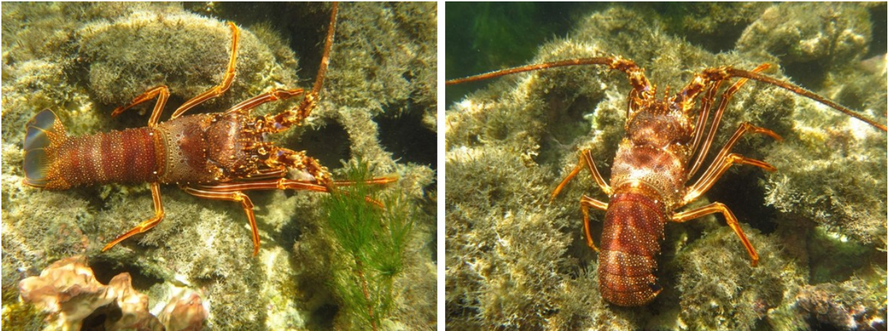
Figure 2. Typical color and pattern of the brown spiny lobster Panulirus echinatus Smith, 1869 in the same location of capture as the blue specimen.