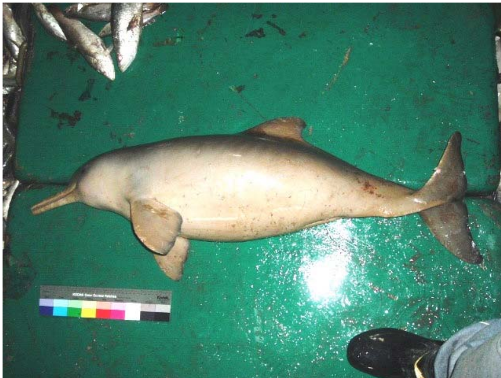
Figure 2. Franciscana dolphin Pontoporia blainvillei incidentally caught by pair-trawlers in Southern Brazil. The scale is 30cm long.

Differences between the high yearly number of franciscana dolphins incidentally caught in gillnets (e.g. Secchi et al. 2004), in comparison with the scarce records on trawling nets, can be due to operational differences between these two fishing methods. Gillnets are used mostly in coastal waters below 30 m depth (Secchi et al. 1997, Boffo & Reis 2003), which are the main habitat of franciscana dolphins (Bordino et al. 2002, Danilewicz et al. 2009), while trawl nets are operated mostly beyond