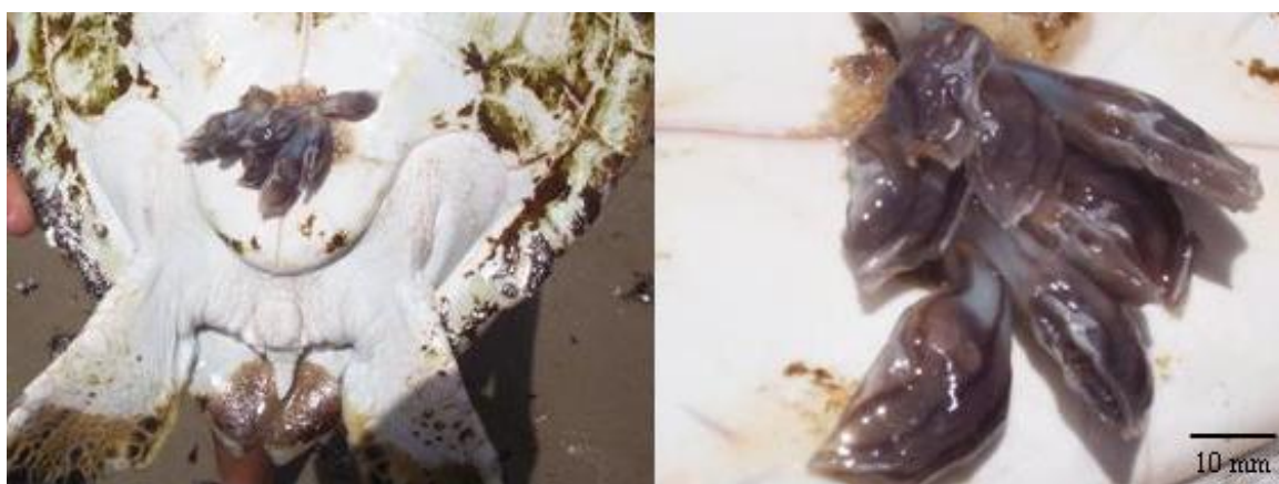
Figure 2. Juvenile green turtle ( Chelonia mydas ) hosting Conchoderma virgatum attached to the plastron.

The individuals of C. virgatum were attached either directly to the turtle body (Fig. 2) or to Platylepas hexastylus (Fabricius, 1798), an obligate commensal barnacle of sea turtles (Monroe & Limpus 1979). The number of specimens hosted by turtles varied from 1 to 10, with clumped specimens more frequent than solitary ones.