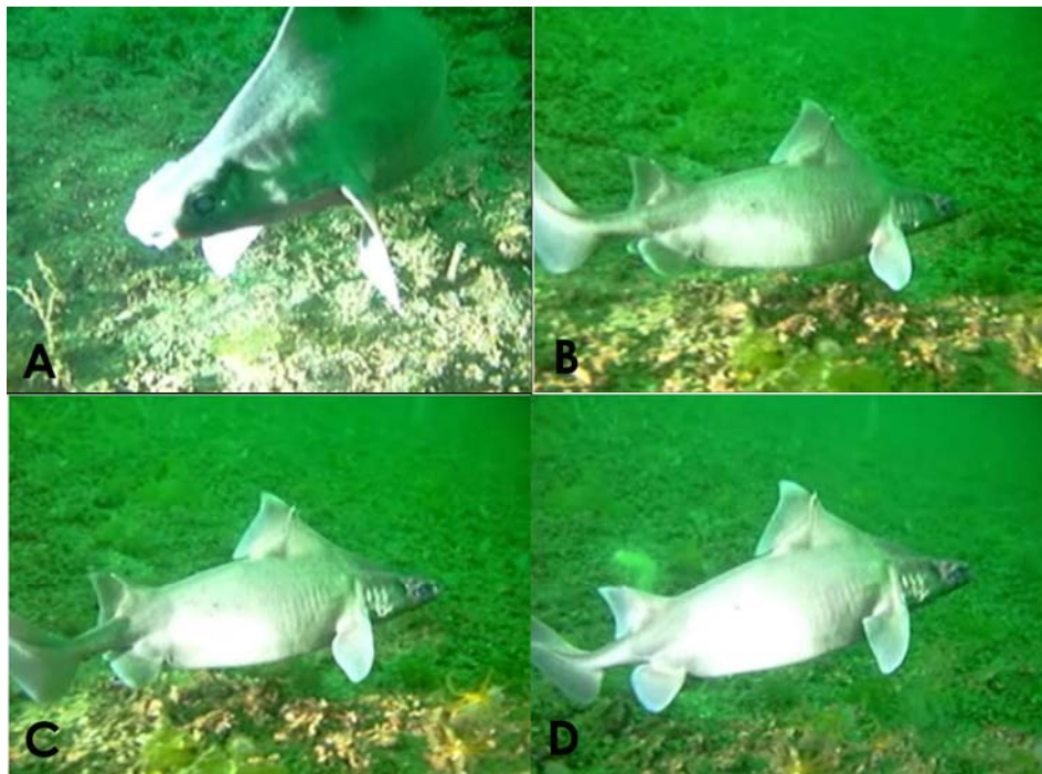
Figure 2. Patterns of movement observed in the present specimen of Oxynotus centrina . Posture of the pectoral fins is markedly changed relative to the direction of movement; (a) posture of pectoral fins during vertical maneuvering or hovering; (b) at the beginning of maneuver up, trailing edge of the pectoral fins are lowered; (c) during the progression of maneuver up, trailing edges of pectoral fins are kept in the lowered posture; and (d) before the beginning of horizontal movement, pectoral fins are returned to natural posture. All images are captured from the video footage recorded on 27 September 2009, between 16:00 to 16:05 hours.

Due to the limited knowledge on the biology of O. centrina , the observations put forth herein on a solitary individual, has increase the general understanding of this species in Mediterranean waters ( e.g. Barrull & Mate 2001, Megalofonou & Damalas 2004, Dragičević et al. 2009).