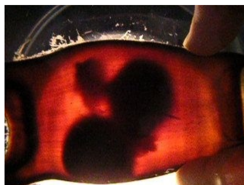
Figure 2. View of an egg case contained two embryos, observed by transmitted light.