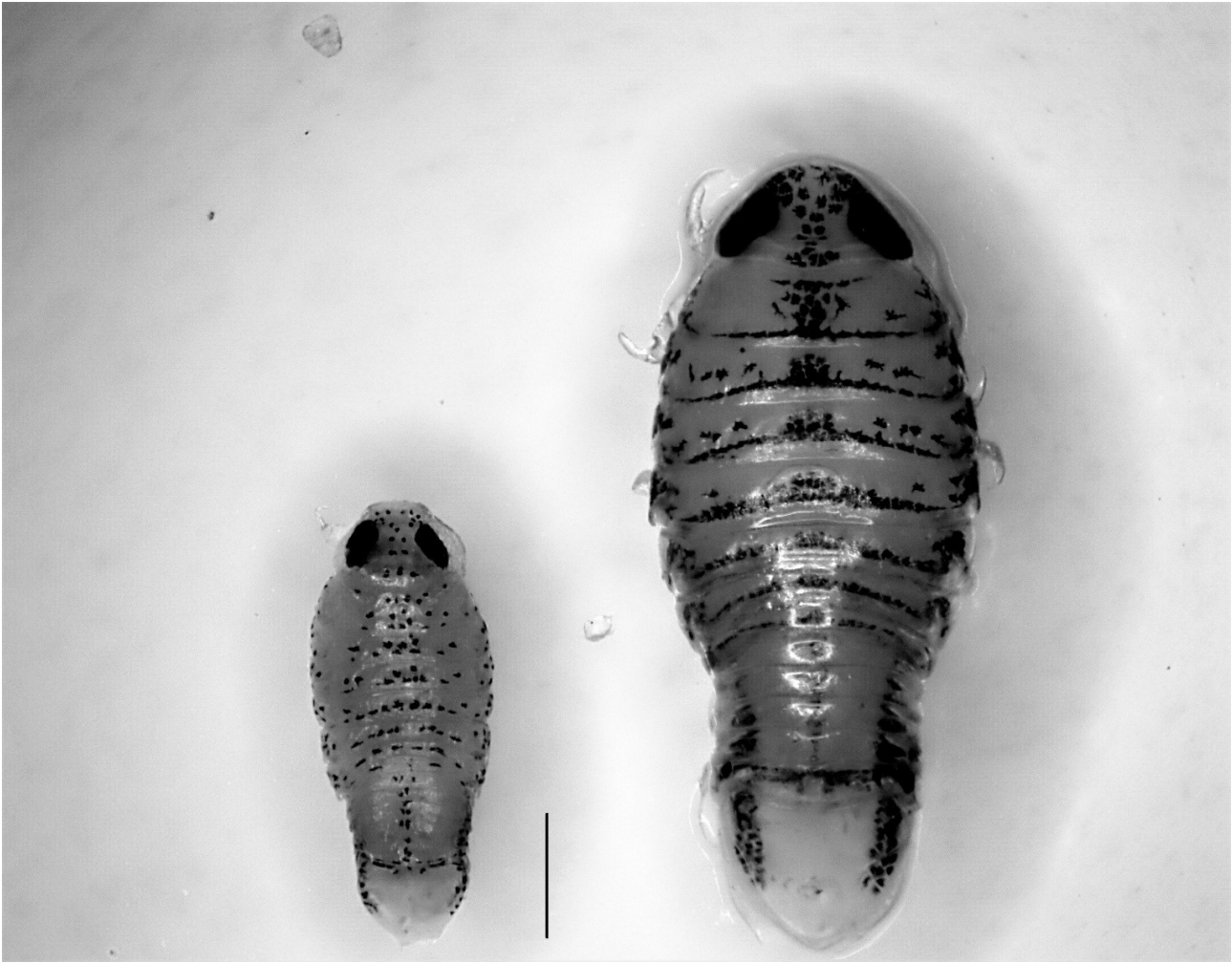
Figure 3. Dorsal view of our smallest and largest Riggia cryptocularis specimens. The black line represents 1 mm.

coves where detritus can settle while the other sites have faster flowing water. As a result, a higher proportion of Odontostilbe diets could come from other food sources, causing them to spend less time on the river bottom and making them less vulnerable to manca attacks. Site 1 is particularly interesting because four times as many O. pequirá were sampled but only one parasite was found, which was infecting O. paraguayensis . This could suggest niche partitioning between species at this site, with O. paraguayensis consuming more detritus or other bottom dwelling food items while O. pequirá occupies higher areas in the water column.