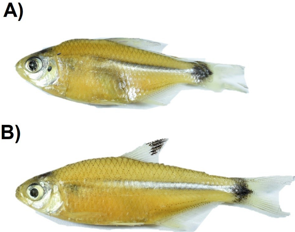
Figure 2. Voucher specimens of A) Odontostilbe paraguayensis and B) Odontostilbe pequirá .

Leporinus striatus (Anostomidae), Monocirrhus polyacanthus (Polycentridae), Plagioscion squamosissimus , Rhamdia quelen (Pimelodidae), and Steatogenys elegans (Hypopomidae) span at least five countries in South America (Table IV). Host size information was included for only 16 species from studies reporting Riggia infection (not including this study), and there was considerable variation in how maximum length was reported across fish species on FishBase, with eight species listed as standard length (SL; omitting caudal fin) and 18 as total length (TL; including caudal fin). As a result, of these inconsistencies, drawing comparisons across species is difficult. The smallest infected fish was Hypostomus commersoni , which was around 2.5 cm (SL) with a young R. paranensis manca (Alberto 2008) but can grow to 60.5 cm (TL). In contrast, Hisonotus laevior specimens were 3.5–4 cm (SL) when infected with adult R. paranensis (Albert 2008) but have a maximum TL of only 7.5 cm.